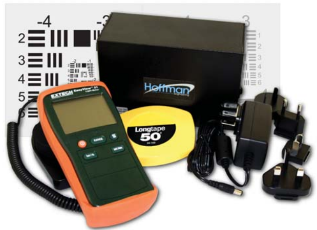
LM-33-550 Test Kit Contents